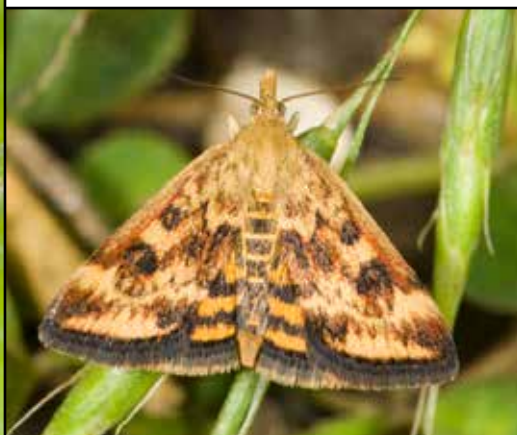
Red Milkweed Beetle (left); Pyrausta Moth (above)