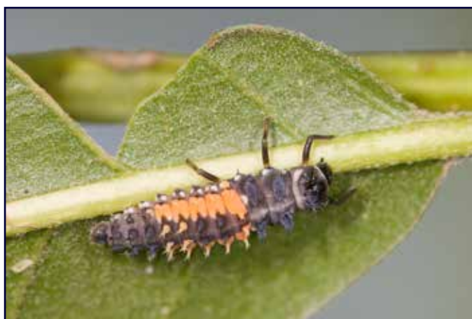
Multicolored Asian Lady Beetle, Harmonia axyridis

Powell Gardens is at 1609 N.W. U.S. Highway 50 in Kingsville, Missouri. You can find out more about Powell Gardens at https://www.powellgardens.org/