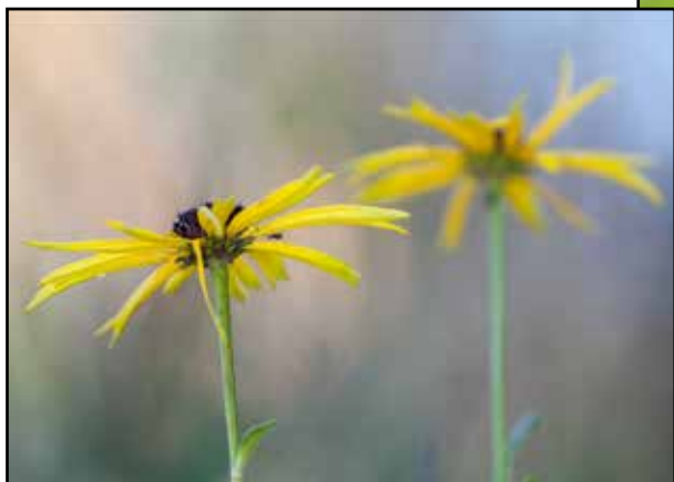
Flowers in Runge's savanna restoration habitat appear on one of my newest greeting cards.

A list of insects I've identified at Runge is available at http://donnabrunet.com/pages/insects/checklists/checklists.html .