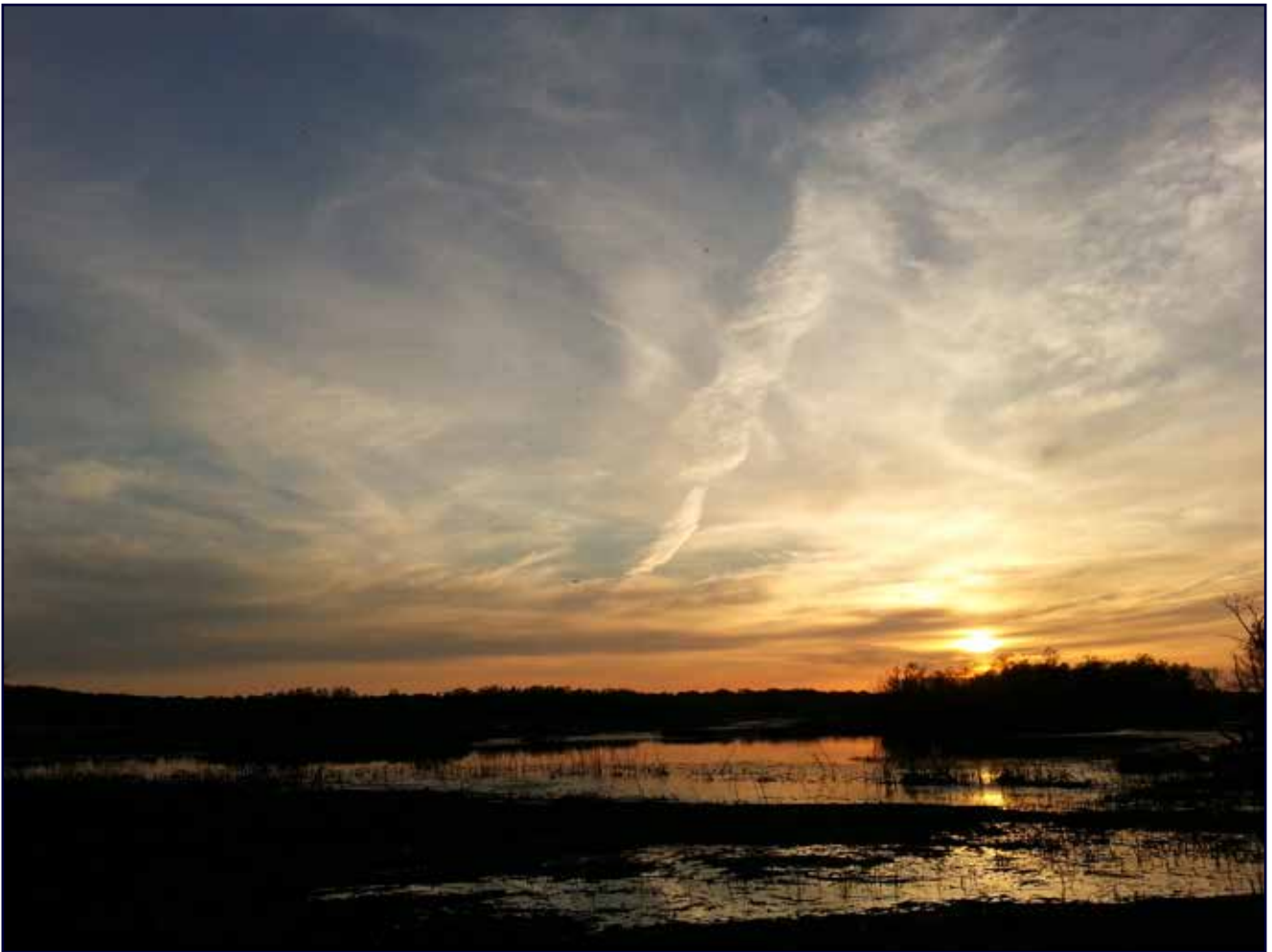
Sunset at Eagle Bluffs Conservation Area, March 5, 2013