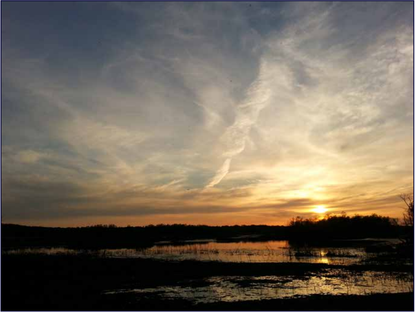
Sunset at Eagle Bluffs Conservation Area, March 5, 2013