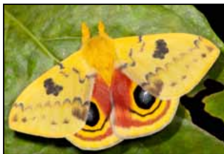
Io Moth Automeris io Bennett Spring State Park

http://www.youtube.com/watch?v=eUYT4mbH_Nk&feature=relmfu