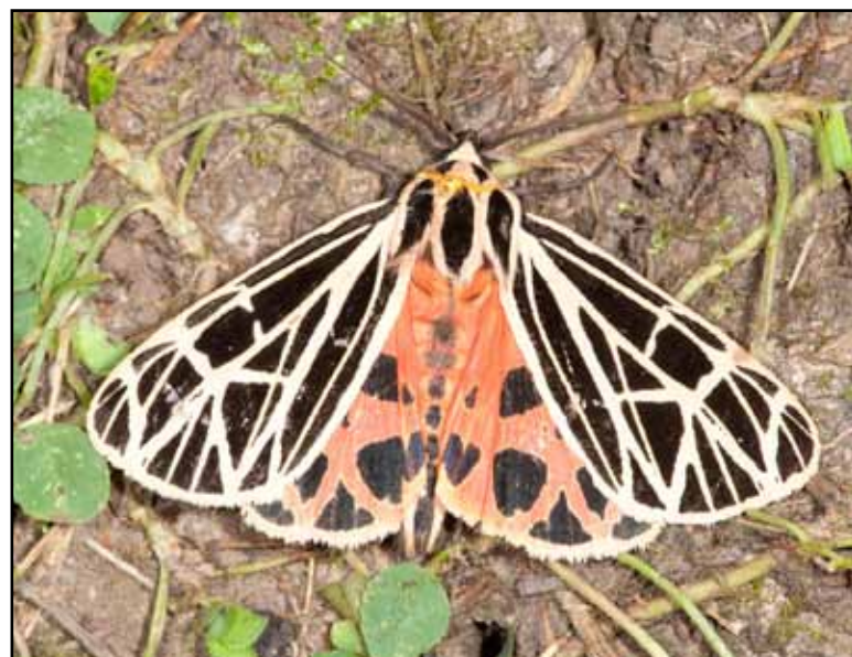
Virgin Tiger Moth, Grammia virgo Battle of Athens State Historic Site

http://mothphotographersgroup.msstate.edu/MainMenu.shtml